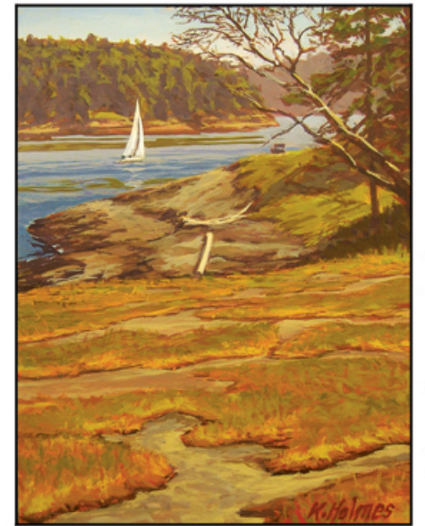
SAILING ACTIVE PASS BY KEITH HOLMES