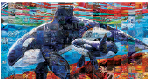
Kunamokst Galiano Mural - 11'x21' with 231 squares, 31 by Galiano Artists. The mural's permanent home is the Galiano Oceanfront Inn. www.muralmosaic.com/kunamokst.html

Dec. 19-24. Island's Edge gallery of fine art